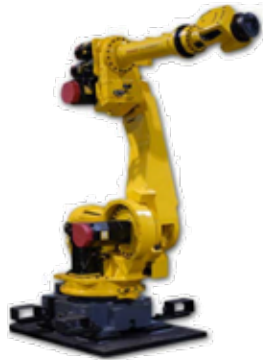
ABB Fanuc Motoman Amplifiers E-Stop Boards Axis Control Motors Cards Power Supplies Control Cards Teach Pendants